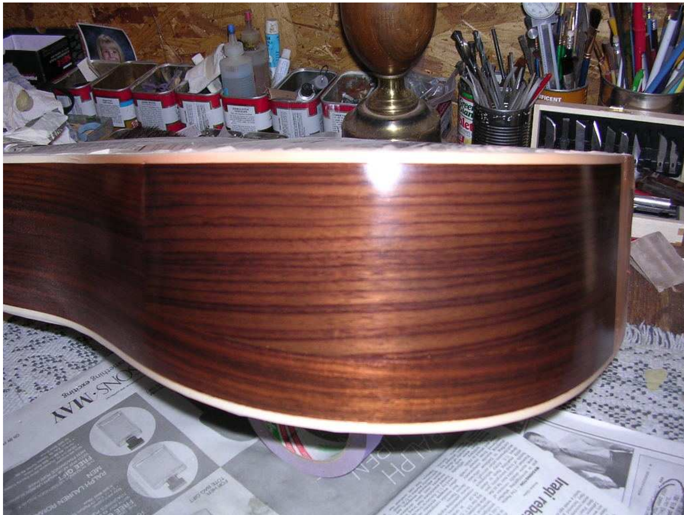
Extreme Guitar Repair

I got a set of rosewood replacement sides from Martin in order to match the curve and wood type. The grain did not match all that well but as you can see the finished repair is barely visible. Due to the way I backed and re-enforced the patch, the repair is stronger than the original unbroken wood.