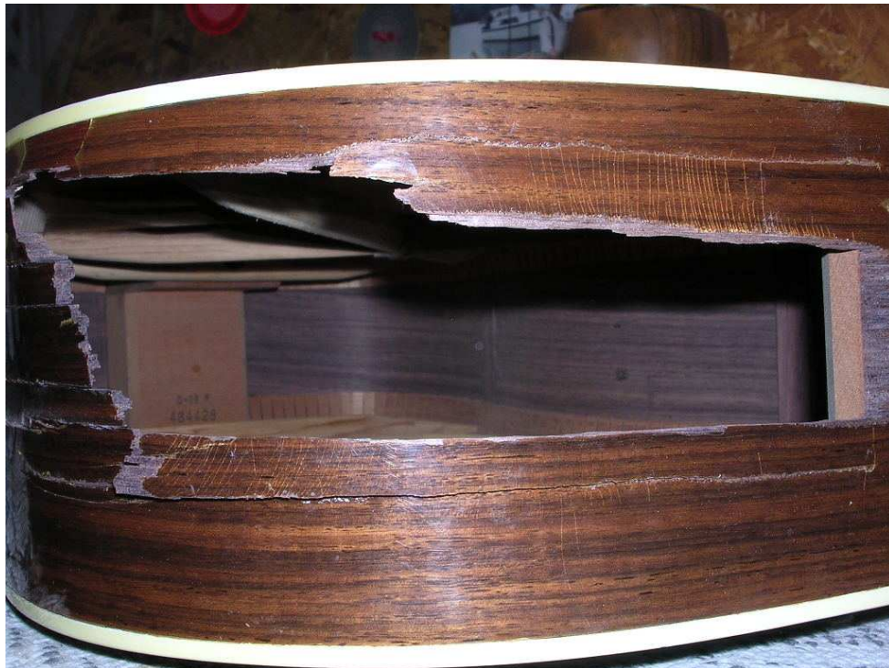
Rather extensive damage