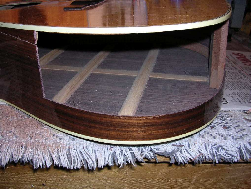
Damaged Area Removed